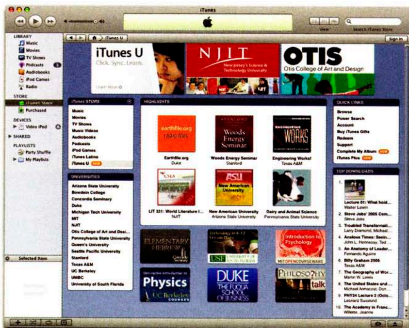
Online School Through iTunes U, colleges and universities offer up audio and video study materials through the iTunes Store.

iTunes U Apple recently dedicated an area within the iTunes Store that it calls iTunes U—a program that enables higher-education institutions to share content with students via the iTunes interface. Accessible through the iTunes Store box on the Store's home page, iTunes U features audio and visual content from a number of schools, including MIT; Penn State; Stanford; and the University of Cali-